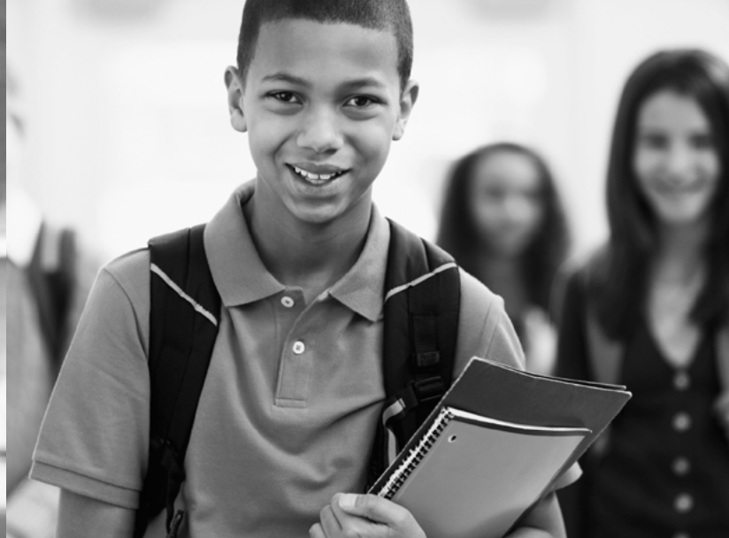
Middle School Students