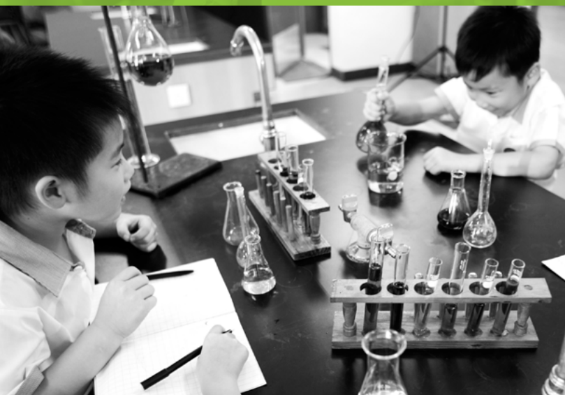
GATE & STEM Students (Science, Technology, Engineering , Mathematics)