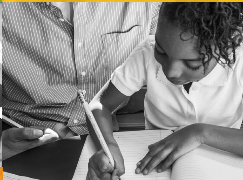
Home School Students