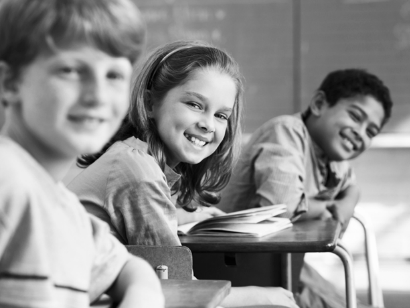
Elementary School Students