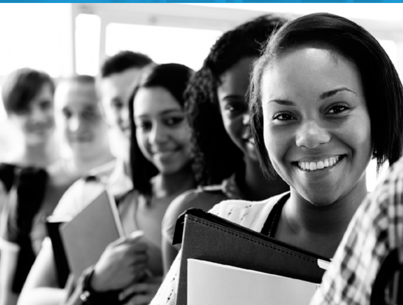
High School Students